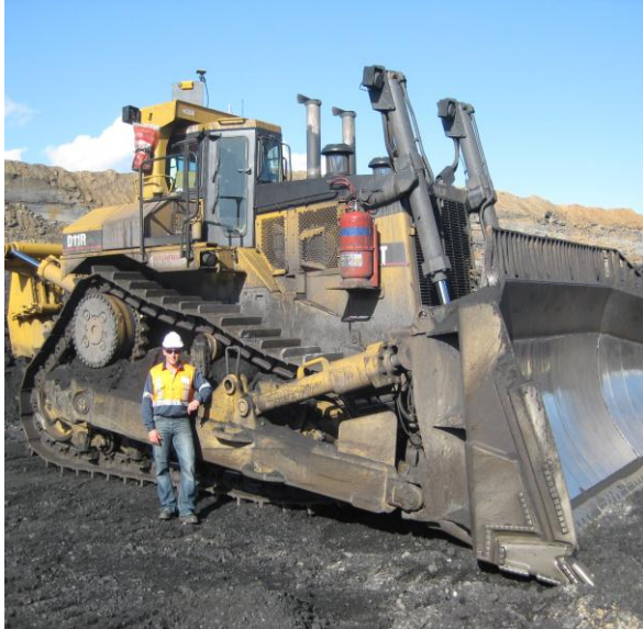
Equipment that will be using our purpose design slabs